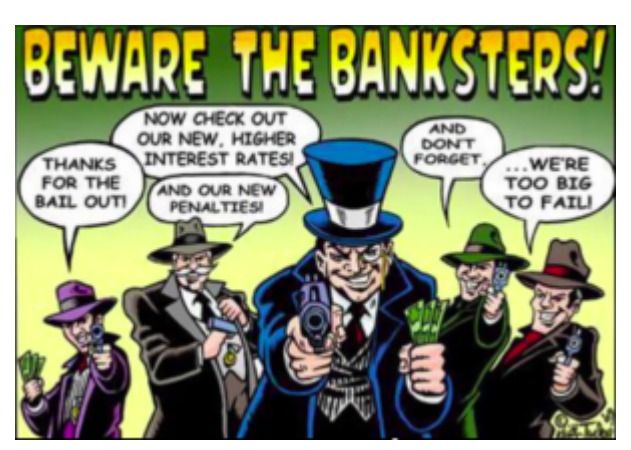
PREDATORS EXIST: BE ON YOUR GUARD.

Some thirty years on and the RM is in a situation more poverty stricken (or rather, more cash-strapped ) than he has ever been in. This was a direct consequence of him falling for one of the most treacherous swindles the money controllers use against the people: a mortgage [the Dead Pledge ].