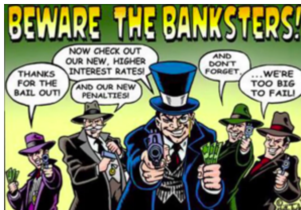
PREDATORS EXIST: BE ON YOUR GUARD.

Some thirty years on and the RM is in a situation more poverty stricken (or rather, more cash-strapped ) than he has ever been in. This was a direct consequence of him falling for one of the most treacherous swindles the money controllers use against the people: a mortgage [ the Dead Pledge ].